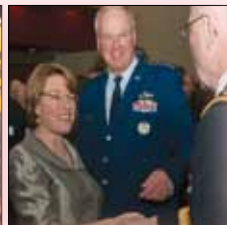
Sen. Amy Klobuchar