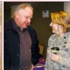
Rep. Tim Walz 1st District

Rep. Walz, a former Command Sergeant Major in the Minnesota National Guard, addressed the 106th National Guard Association of Minnesota Conference in Rochester.