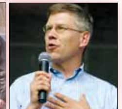
Rep. Erik Paulsen 3rd District

Rep. Paulsen cooked steaks for Soldiers and families of the Bloomington-based 1st Brigade Combat Team at the "Serving Our Troops" meal in Ft. McCoy, Wis.