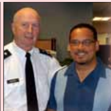
Rep. Keith Ellison 5th District