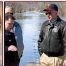
Rep. John Kline 2nd District

Rep. Kline, a member of the House Armed Services Committee, traveled throughout the 2nd District to discuss flood mitigation efforts, which included a response from the Minn. National Guard.