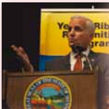
Gov. Mark Dayton

Gov. Dayton presided over proclamation ceremonies of Yellow Ribbon Communities throughout Minnesota. These networks are vital to ensuring returning Servicemembers are reintegrated.