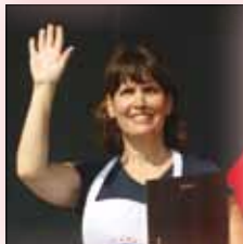
Rep. Betty McCollum 4th District

Rep. McCollum presented a proclamation of support to the Citizen-Soldiers of the 1st Brigade Combat Team, 34th Infantry Division, prior to their deployment to Kuwait.