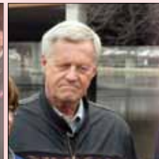
Rep. Collin Peterson 7th District

Rep. Peterson visited Minnesota National Guard Soldiers and Airmen as they executed the emergency response with local authorities during Red River Valley flooding.