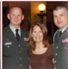
Rep. Michele Bachmann 6th District

Rep. Bachmann ensured support to Minnesota Soldiers, Airmen and their families through legislation, and ensuring representation at deployment ceremonies and events.