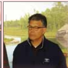
Sen. Al Franken

Sen. Franken observed first-hand the Citizen-Soldiers and -Airmen called up to support local authorities during the northern Minnesota wild fires.